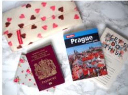
WAYS TO PREPARE & BE ORGANISED WHEN TRAVELING