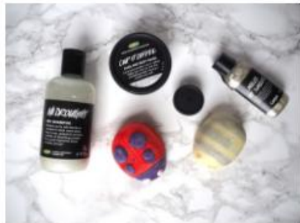
BEAUTY HAUL | A FEW NEW BITS FROM LUSH